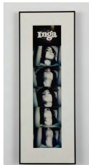
John Waters, Inga #3 , 1994. 6 C-prints. Each image: 5x7 inches. Framed 37 1/4 x 13 3/4 inches. Edition 2 of 8. Signed, titled and numbered in ink (verso)