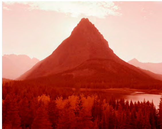
David Benjamin Sherry, Crown of the Continent , Montana, 2011, 2012, traditional color darkroom photograph, 40 x 50 inches.

September 26 – November 1, 2014 1500 Elm Street, Over-the-Rhine in Cincinnati